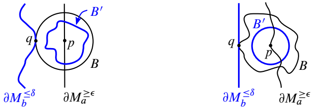
Figure 3: The proof of Theorem 9.15 . The left and right panels illustrate how the region near q looks in the g_a metric and g_b metric, respectively. Black objects are in the g_a metric and blue objects are in the g_b metric.

Thus, a \in I ; hence, I is nonempty. Also, I is open because (9.20) involves a strict inequality, and hence is an open condition. We will show I is closed, which will imply that I = [0, (2\pi)^2] .