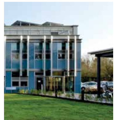
In 2009 the Clinical Trials Unit building was completed at Gibbet Hill at a cost of £400m.