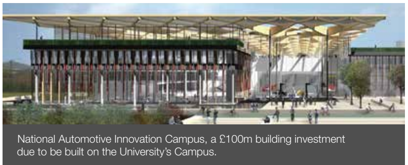
National Automotive Innovation Campus, a £100m building investment due to be built on the University's Campus.

In 2012 New York's Mayor Michael R. Bloomberg announced that Warwick would be the only European university involved in a consortium of world-class universities and multinational corporations that would create a brand new campus in downtown Brooklyn. The Centre for Urban Science and Progress will use cutting-edge research techniques like 'living laboratories' and real-world data to address the major challenges facing cities across the globe. Warwick's involvement will connect the region to this ground-breaking initiative, helping policymakers better understand how cities can deliver services more effectively, efficiently, and sustainably, while keeping their citizens safe, healthy, prosperous, and well-informed.