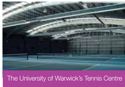
The University of Warwick's Tennis Centre

Warwick's new £2.5 million Tennis Centre, funded by the University of Warwick, the Lawn Tennis Association, Sport England West Midlands and an anonymous benefactor, offers a comprehensive adult and junior programme for players of all standards. The Centre is the only one of its kind in Coventry and Warwickshire to offer access to the public without having to take up a membership.